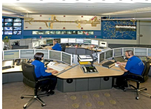
Tuesday, April 10, 2018