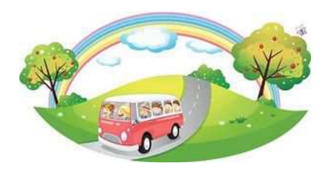
May 12 Sonja's day trip into the blue!