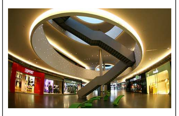
Tuesday, April 3, 2018

An English guided tour through and behind the scenes.